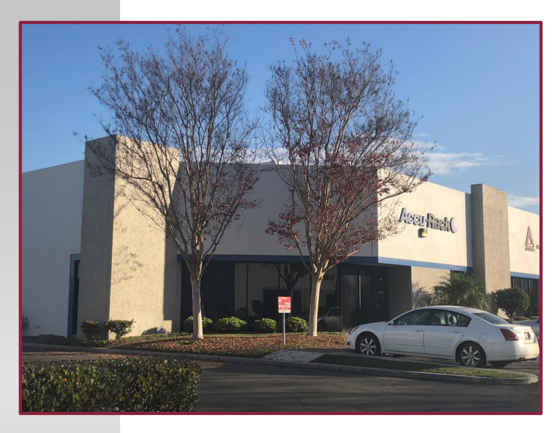
1961 Miraloma Ave., Ste. D, Placentia